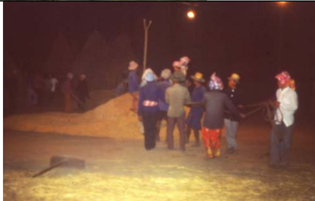
Singing Pleng Chak Kradan