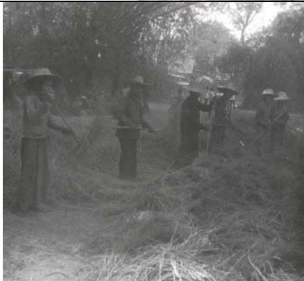
Singing Pleng Pan Fang