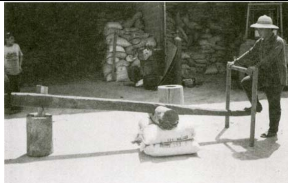
A different type of mortar is used by a Thai male farmer.