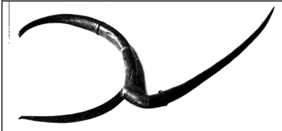
(Above) Sickles from different parts of Thailand and a rice cutter from the Southern region. (Left) A Khmer or Cambodian sickle.

Hay stacks on stilts in paddy field Karnataka, one of the four southern states of India. (Wikipedia, the free encyclopedia)