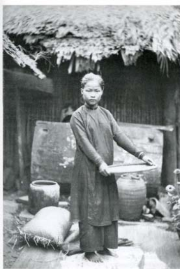
15. Indo-Chinese girl winnowing rice, photographed in the mid-1870s. (John Thomson)