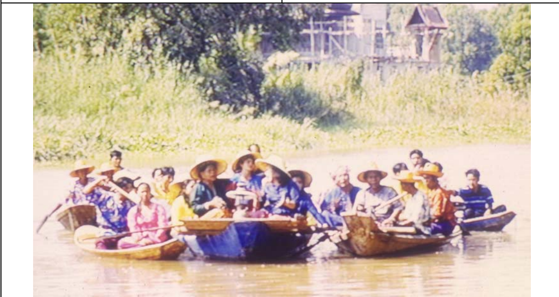
Men and Women paddling, singing boat songs.