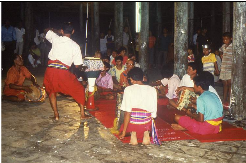
Playing Pleng Klong Yao

After all the work of the harvest had been completed, the farmers saw that the sweat of their brows had been transformed into rice in the granary, and with their cares and worries at an end, they gave themselves up to joyous celebration. They would join on the ground of a monastery nearby, 'played' such songs as Pleng Yua or teasing song, Pleng Yoei or mocking song, Pleng Klong Yao or long drum song, to pass their leisure time merrily.