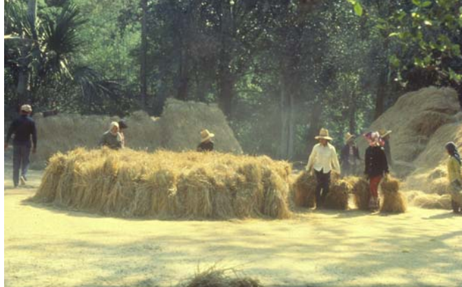
On the threshing floor