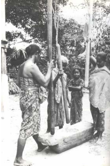
Women in Southern Thailand use a mortar similar to that of the Kenyan.