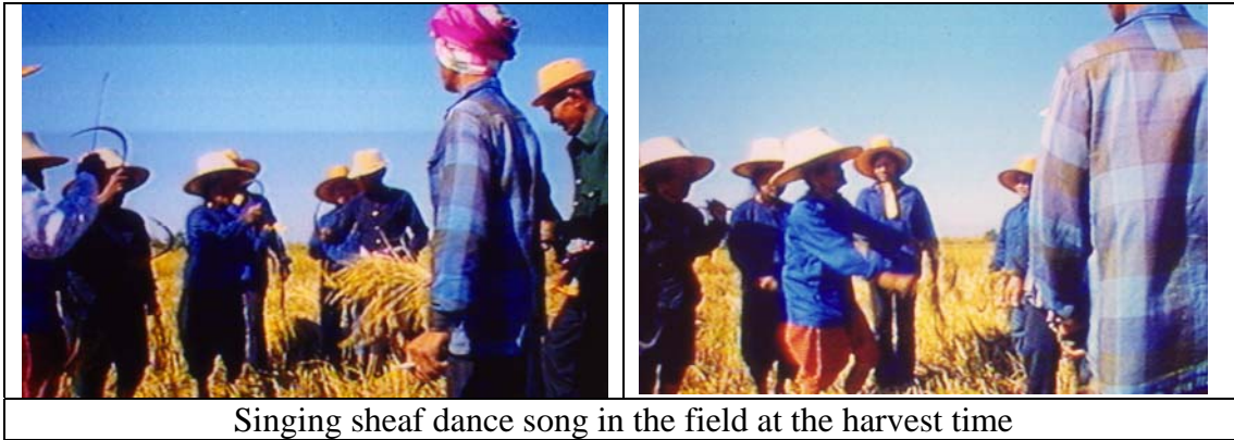
Singing sheaf dance song in the field at the harvest time