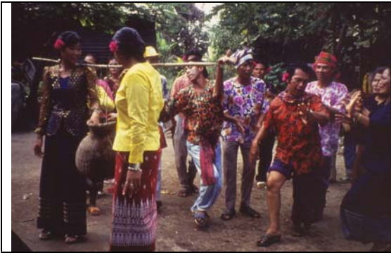
Parading the Cat Ceremony