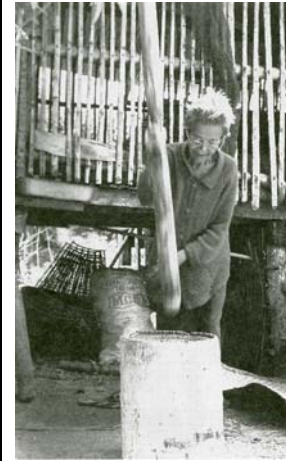
This female farmer uses a mortar for a single husker.